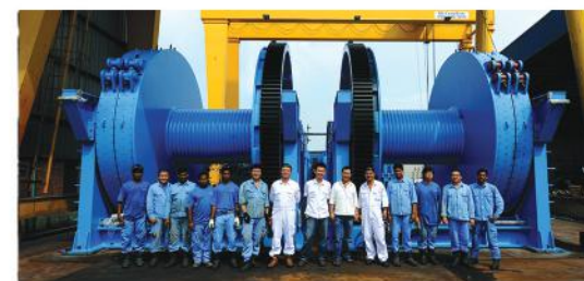
180 ton Double Drum Mooring Winch