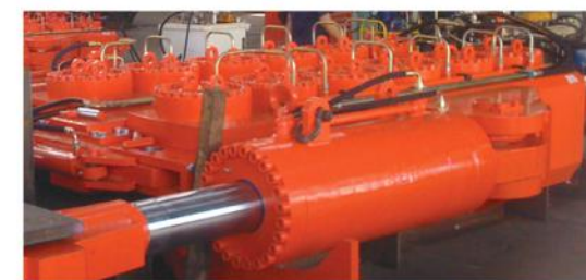
550 ton top side Load Out Skidding System