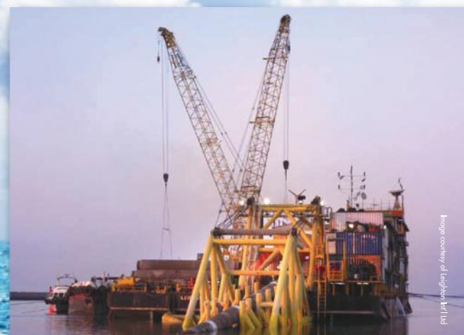
PIPE LAY SYSTEM