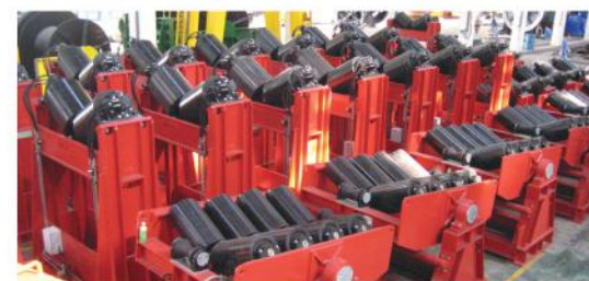
V4 Fixed Roller Support