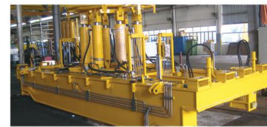
136 ton BOP Tensioning unit