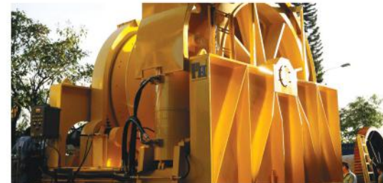
600 ton Turret Winch