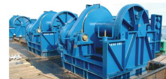
30 ton Mooring Winch