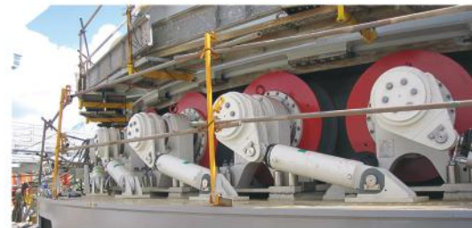
Vertical and Horizontal Turret Bearings