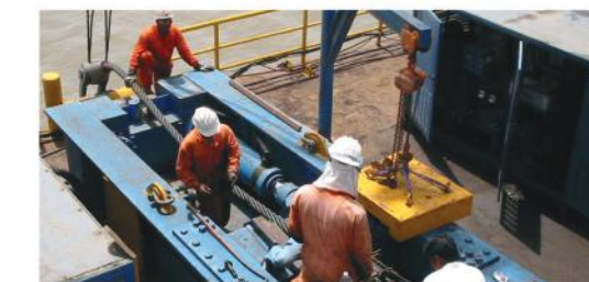
Pipe Pull Operations