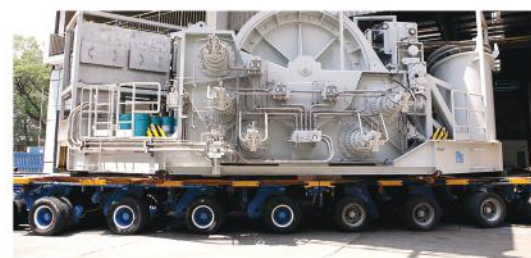
Winch Platform c/w 200 ton Riser Winch, Vertical & Horizontal Sheaves