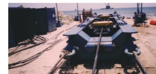
300 ton Linear Winch