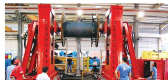
100 ton Reel Drive unit