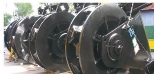
Underwater Fairlead for 120 mm Chain