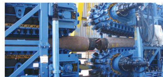
2 x 70 ton Hydraulic Tensiometer