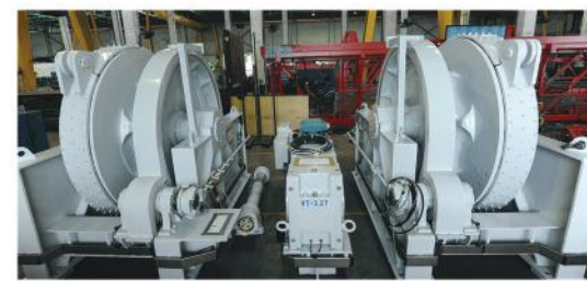
62 ton Anchor Windlass