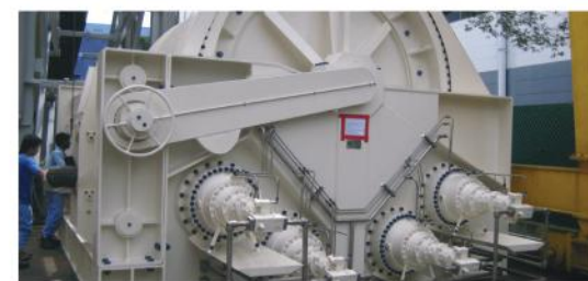
350 ton Turret Riser Pull-in Winch