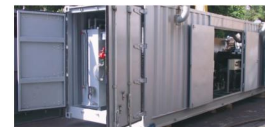
860 HP HPU