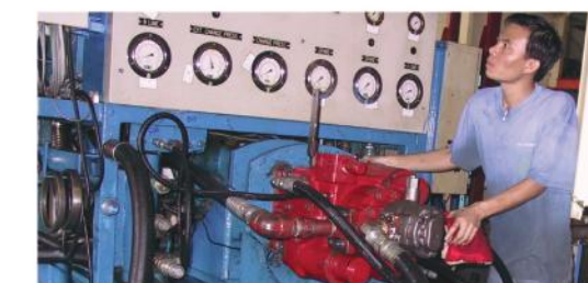
Post repair computerised bench testing