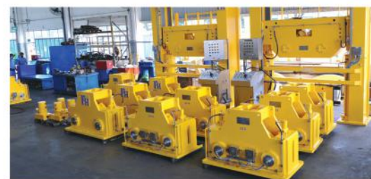
225 ton Chain Jack and 950 ton Chain Stopper