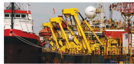
50 ton Pipe Davits with built-in HPU & local / remote controls