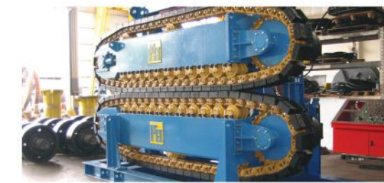
20 ton Tensioner