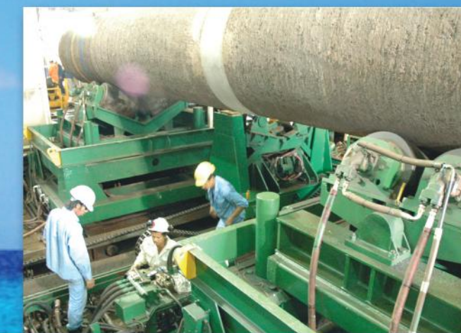
INT'L SITE SERVICES