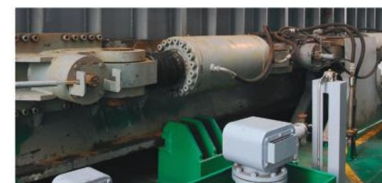
Jacking & Skidding System