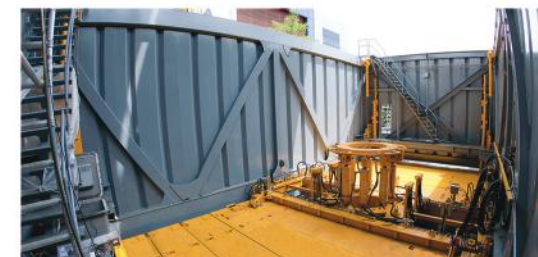
Conductor Tensioning Platform