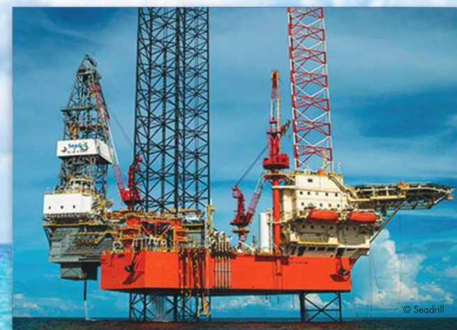
OFFSHORE DRILLING PLATFORM