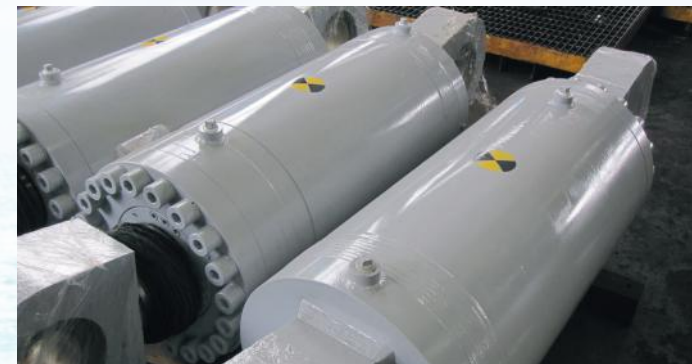
Cantilever/Drill Floor Skidding System