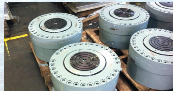
Drillfloor Lifting Cylinder