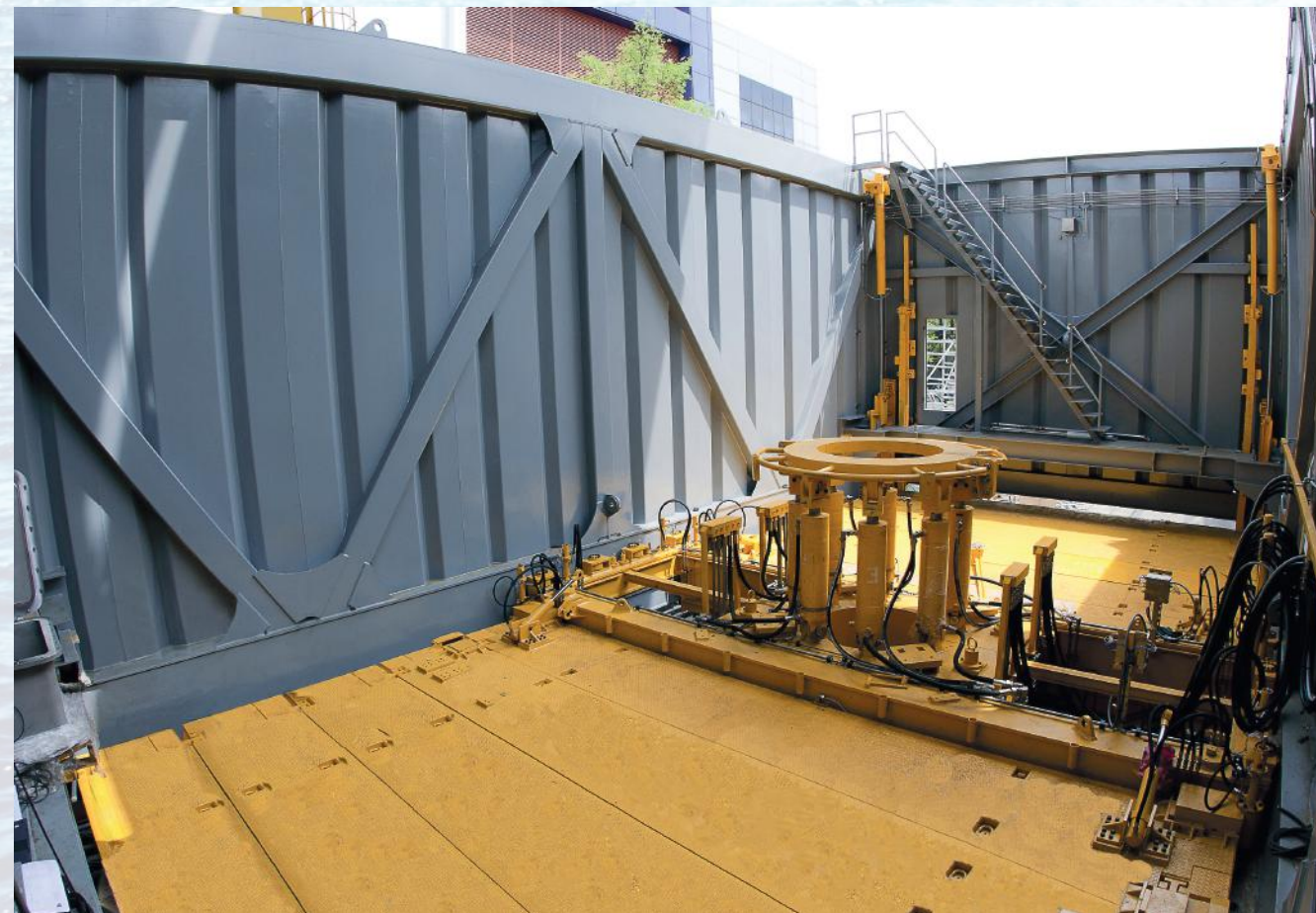
Conductor Tensioning Platform c/w Hydraulic Sliding Panels

The conductor tensioning unit (CTU) is mounted between support rails spanning the conductor tensioning platform (CTP) located below the cantilever drill deck. A secondary vertical tensioning system compensates for the BOP stack loading on the intermediate string.