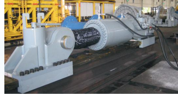
Skidding & Cantilever System

The cantilever skidding is to perform the longitudinal movements of the cantilever from store area to working area. The drill floor skidding is to perform transverse movements of the drill floor as the drilling working requirement.